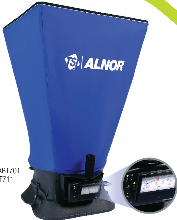
Model ABT701 and ABT711