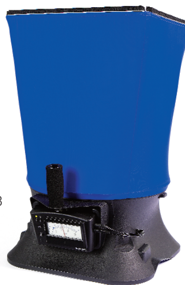
Model ABT703 and ABT713